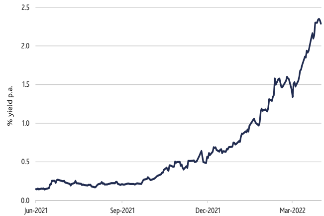
Fig. 1: US 2-Year Treasury Yields