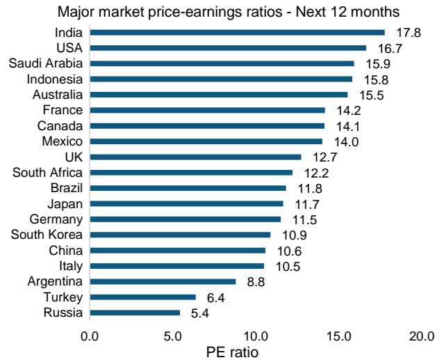
Correct as at 1 April 2019

The PT quarterly report will be available on our website on 10 April 2019.