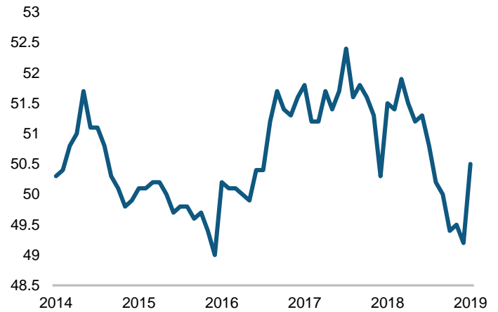
Correct at 5 April 2019.