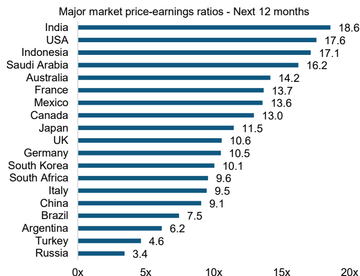
Source: Chart 1 – IBES consensus, in local currency. Correct as at 6 June 2022.

What is lacking is a relaxation of China's restrictive policy in regards to Covid given its hitherto failed response to the disease. News of successful vaccine development in Western markets was a major catalyst for improved performance in the wake of the Covid sell-off of 2020. We see no reason why news of a successful mRNA vaccine in China would not have a similar effect, with potentially significant outcomes for China, the region, and indeed, cyclical equities globally.