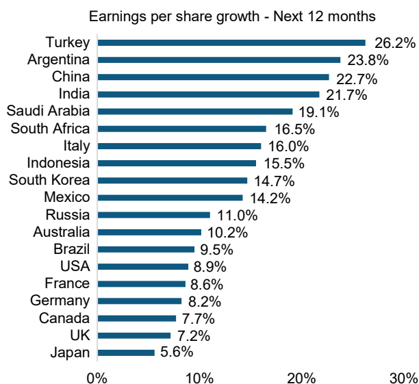
Source: Chart 2 – IBES consensus, in local currency. Correct as at 6 June 2022.