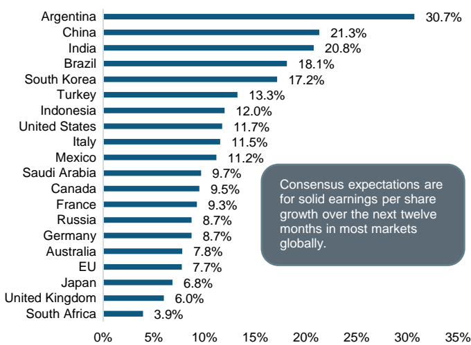
Chart¹- Major market EPS growth