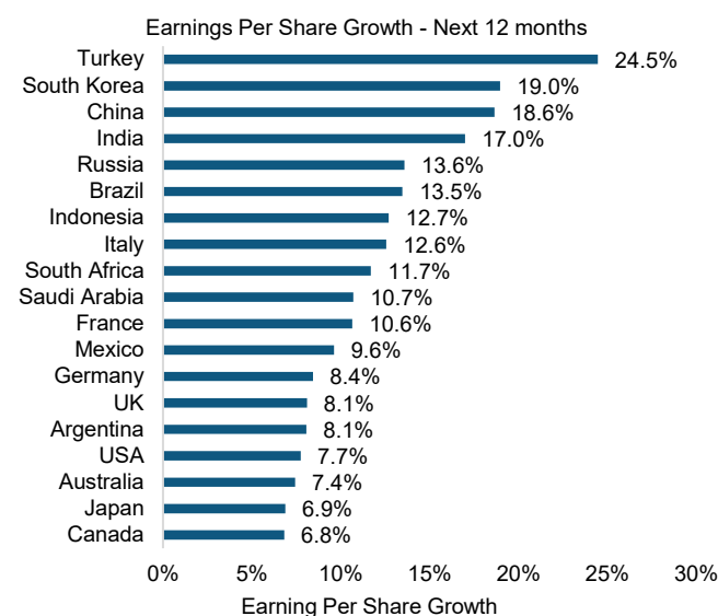
Source: Chart 3 – IBES consensus, in local currency. Correct as at 2 March 2020.