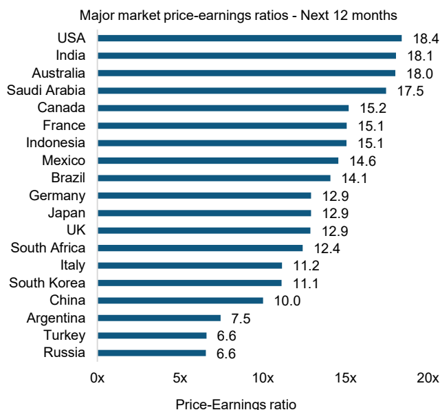
Source: Chart 2 – IBES consensus, in local currency. Correct as at 2 March 2020.