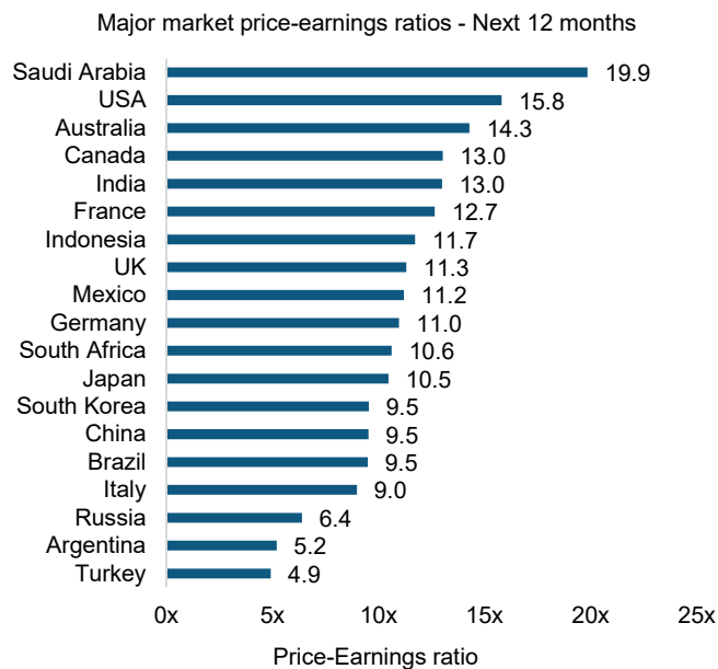
Source: Chart 1 – IBES consensus, in local currency. Correct as at 5 April 2020.

Quarterly Report will be available online in April.