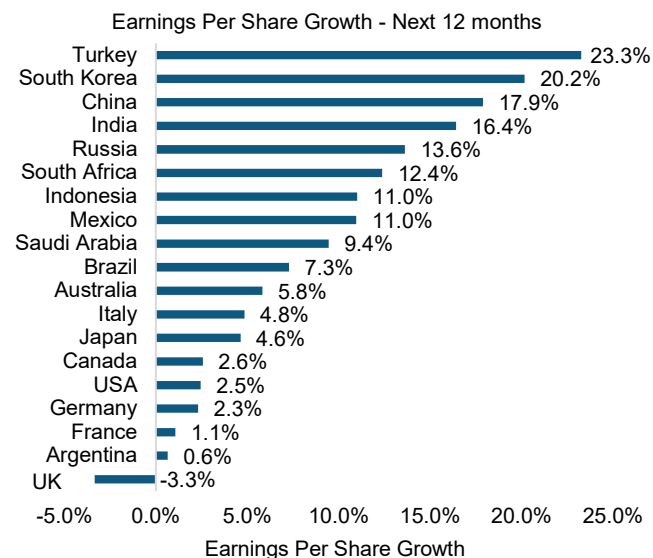
Source: Chart 2 – IBES consensus, in local currency. Correct as at 5 April 2020.