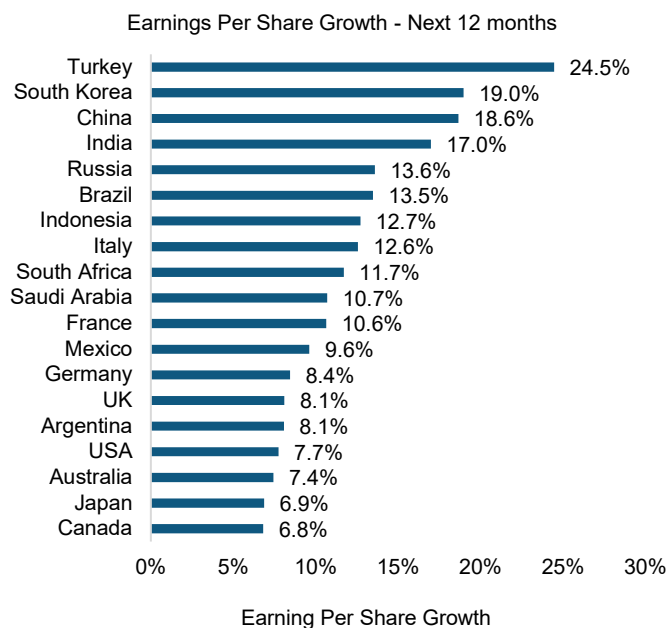
Source: Chart 2 – IBES consensus, in local currency. Correct as at 31 January 2020.