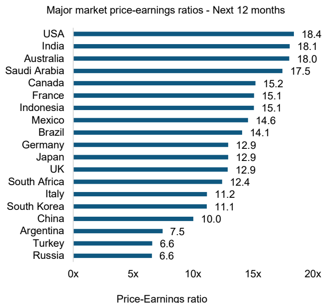
Source: Chart 1 – IBES consensus, in local currency. Correct as at 31 January 2020.

https://www.platinum.com.au/Insights-Tools/The-Journal/Update-re-coronavirus