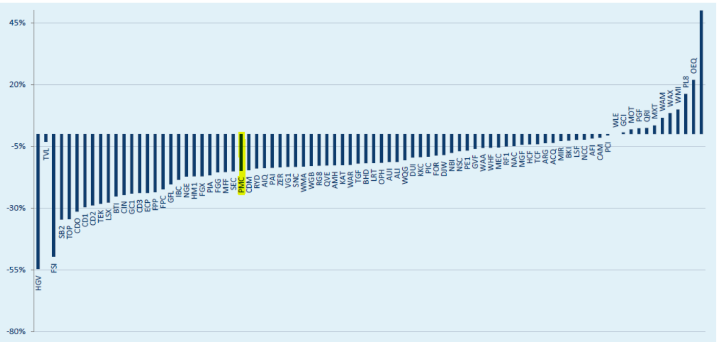
LICs Premium / Discount to NTA as at 29 December 2023