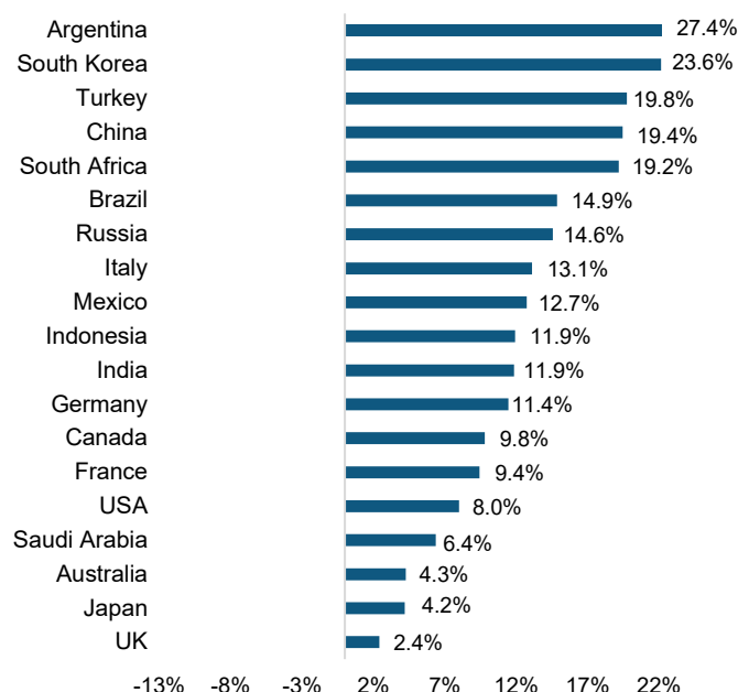
Earnings per share growth - Next 12 months

Source: Chart 2 – IBES consensus, in local currency. Correct as at 7 October 2020.