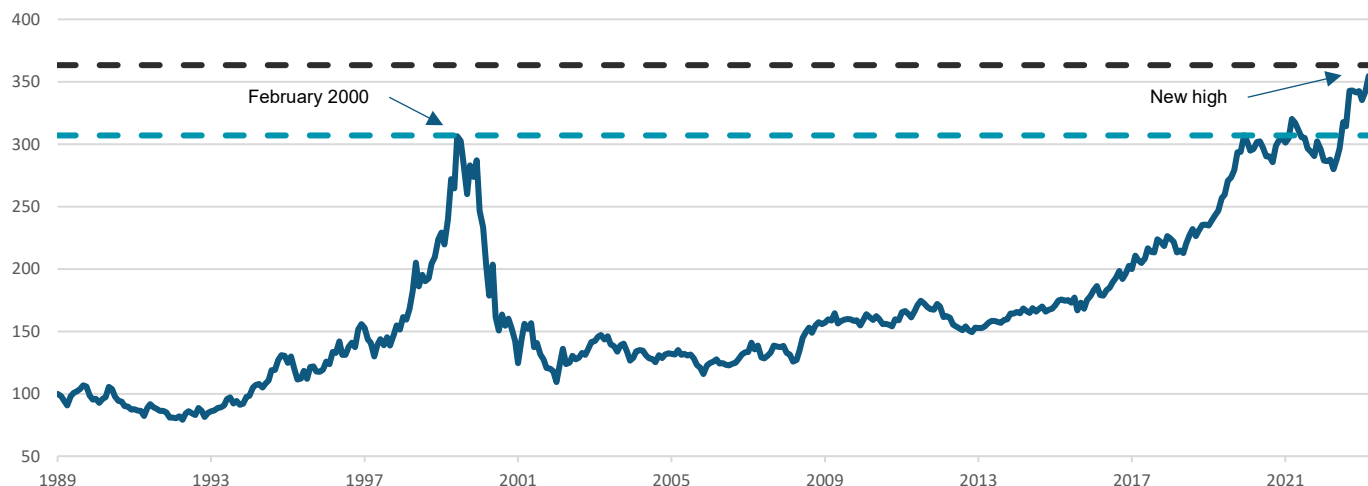
Figure 1: Ratio of S&P500 IT sector vs. S&P500 (monthly total return from 29 Sep 1989 to 26 Feb 2024)