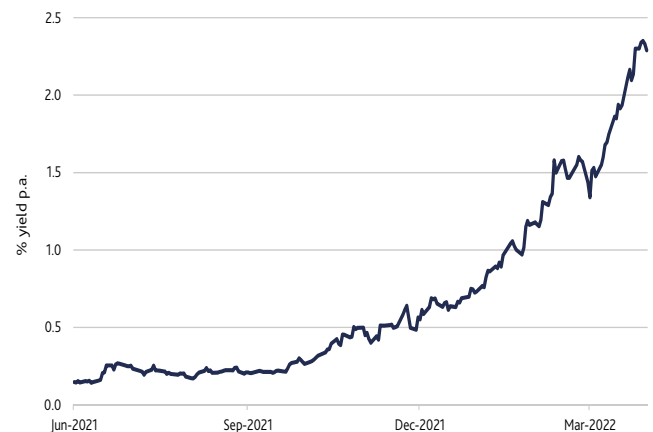
Fig. 1: US 2-Year Treasury Yields