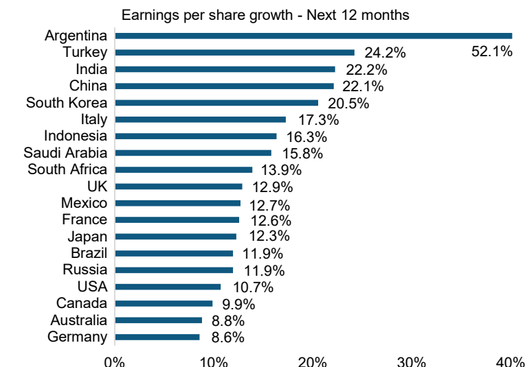
Source: Chart 3 – IBES consensus, in local currency. Correct as at 1 November 2021.