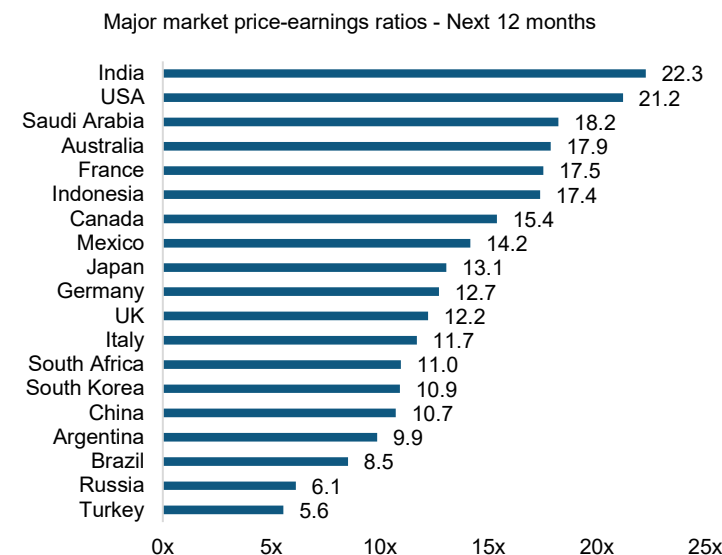
Source: Chart 2 – IBES consensus, in local currency. Correct as at 1 November 2021.