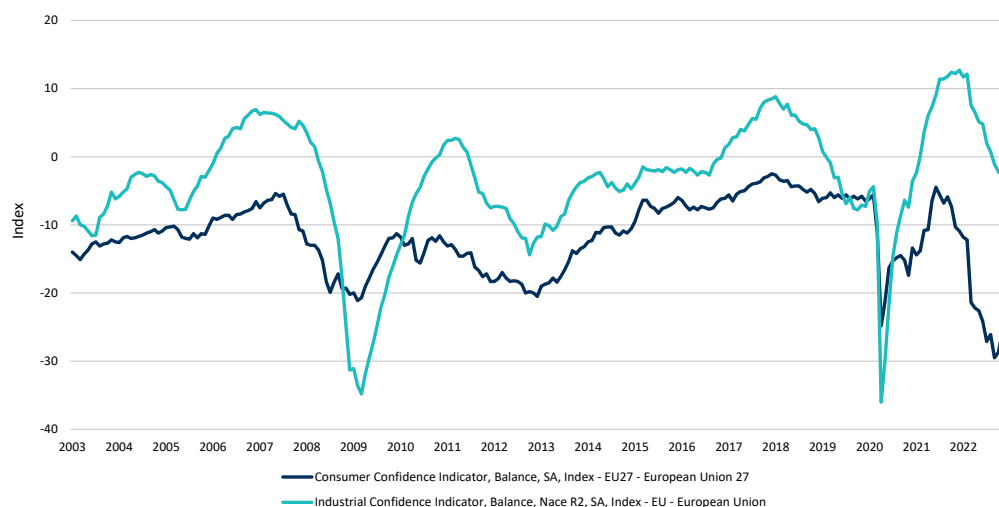
Fig. 2: Consumer and Business Confidence is Incredibly Weak in Europe