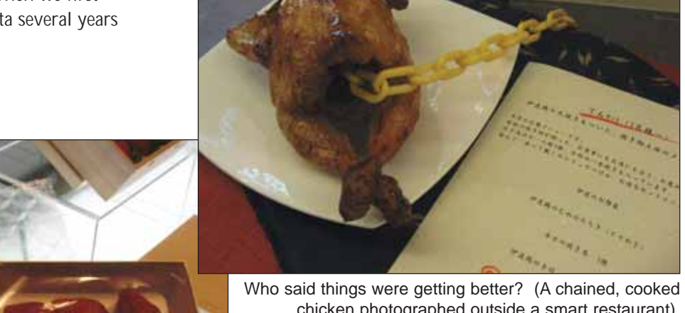
chicken photographed outside a smart restaurant).

ago and suggested that it would be the largest auto maker within a short time, most regarded us with scepticism. We continue to argue that over the next few years, the technical competence of Japanese companies and their financial strength will result in their usurping some of today's champions.