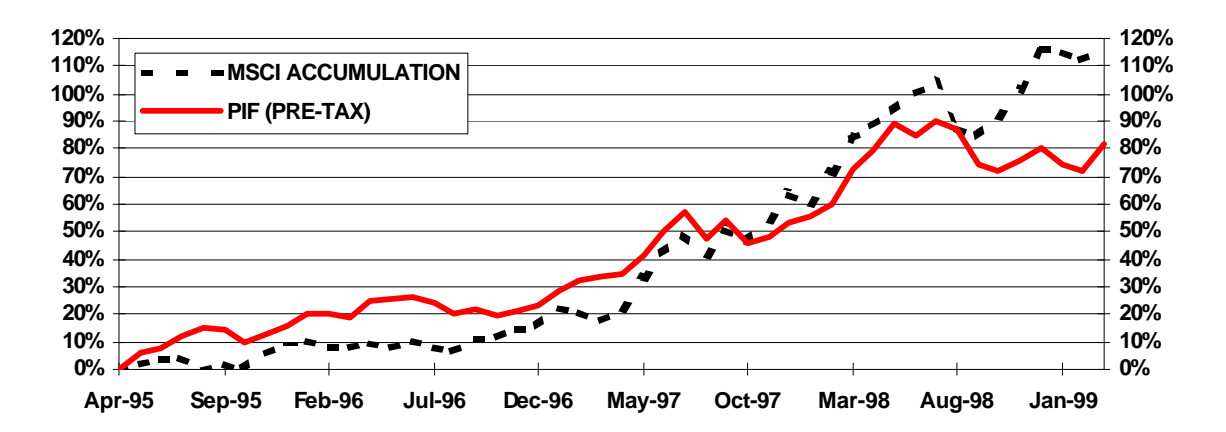
Cumulative Performance versus MSCI World Accumulation Index

The smaller markets have tended to do better than their larger brethren this quarter. Among the latter, Japan stood out with a gain of 9% while the US rose 2.5% and the UK 1.3%. Europe succumbed to soggy economic numbers, with Germany declining nearly 12%, France 5% and Italy 6%. Our performance has benefited significantly from the large position we hold in various Japanese companies. In Europe, several of our holdings have been bid for, notably Telecom Italia, Banca Di Roma and Albright & Wilson which have given a fillip to these holdings and compensated for the neglect of the smaller companies in the portfolio which continue to be overlooked in virtually all western markets.