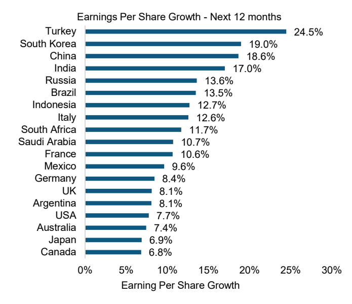
Source: Chart 3 – IBES consensus, in local currency. Correct as at 2 March 2020.