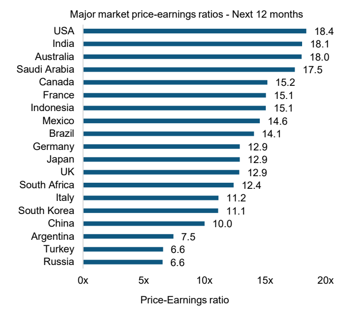
Source: Chart 2 – IBES consensus, in local currency. Correct as at 2 March 2020.