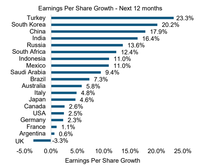
Source: Chart 2-\mathsf{IBES} consensus, in local currency. Correct as at 5 April 2020.