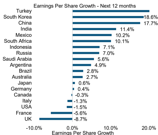
Source: Chart 2 – IBES consensus, in local currency. Correct as at 5 May 2020.

Charts 1 and 2 show valuations based on sell-side consensus estimates. It is worth noting at this stage, that these earnings forecasts will almost certainly come down substantially to reflect the impact of coronavirus-related slowdown in the global economy.