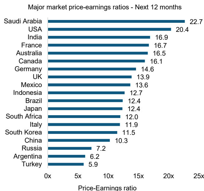
Source: Chart 1 – IBES consensus, in local currency. Correct as at 5 May 2020.

On 3 May, India recorded its highest jump in COVID-19 cases yet, with 2,644 new cases and 83 deaths reported in 24 hours. The increase took India's case count to just over 40,000 as of that date (Source: Economic Times). One must wonder if the case count is accurate in India. There may be significant under counting in our view. All of this means we are unlikely to add significantly to Indian exposure in the near term. Once we get more confidence regarding India's ability to reopen its economy we will seek to add to exposure should the market provide well-priced opportunities. This would likely require genuine herd immunity or a mass produced and accessible vaccine.