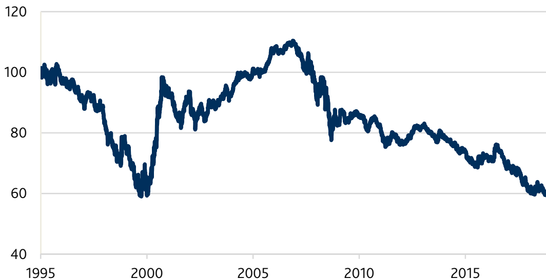
Performance of S&P Value Stocks vs. S&P Growth Stocks Index = 100 as at 30 June 1995