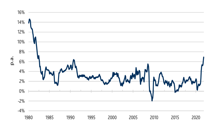
Fig. 1: US Inflation Soars to Highest Level Since the Early 1980s