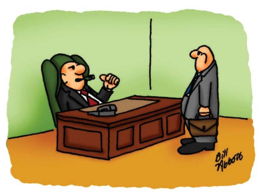
"Okay, what if we go outside - will it still be insider trading then?"