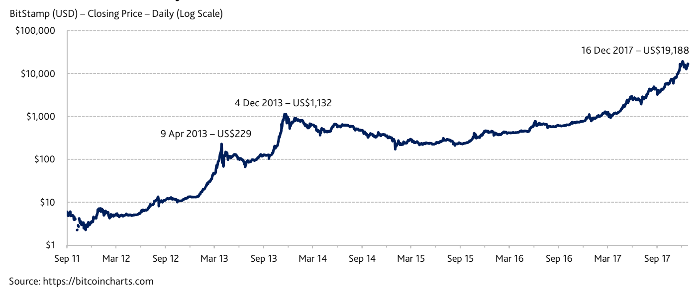
Chart 1 – Bitcoin Price History

fulfilment of needs, strong promotion, and a healthy dose of speculative exuberance. Some of these are discussed in the following sections. The price of US$15,000, which is current at the time of writing, will be used in numbers quoted below.