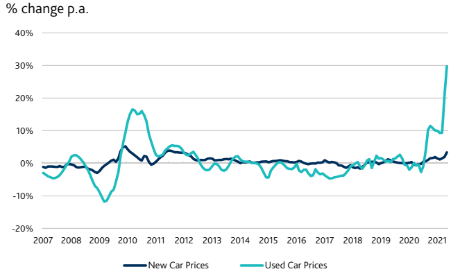
Fig. 2: US New Car vs. Used Car Prices