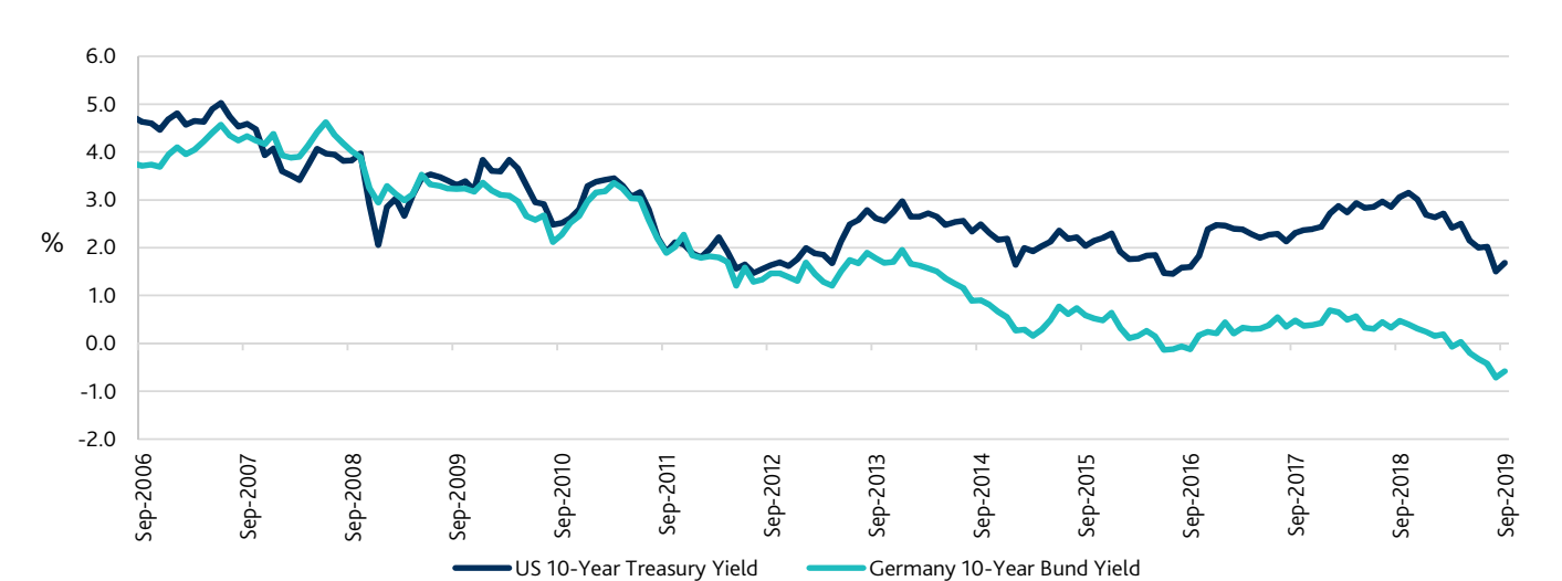
Fig. 1: US and German Bond Yields Plummet in 2019

Unquestionably, global manufacturing is already in a recession, and in this regard, cuts in interest rates by central banks and falling bond yields make sense. However, other indicators suggest that the major economies are relatively resilient, at least for the moment. Most notably, employment remains strong in the US, Europe and Japan. Employment is generally regarded as a lagging indicator of economic activity. However, the fact that the developed economies are still creating jobs (even in the US, which is more than 10 years into its post-GFC recovery) is indicative that we are far from the extraordinarily problematic environment of the GFC, European sovereign crisis, or Chinese slowdown of 2016. It is in this context that the collapse in long-term interest rates is somewhat confounding. That is, that we are at record low long-term interest rates even though we are far from the crises of recent years.