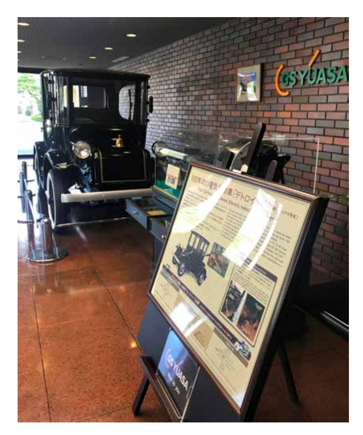
A 1917 electric vehicle named 'DETROIT' on display in GS Yuasa's Kyoto office lobby.

On a recent visit to GS Yuasa, a lead acid and lithium ion battery maker in Kyoto, the display in their office lobby was an electric car from 1917 with the following description: "The history of the electric vehicle dates back to 1873 when the first electric vehicle was assembled in England. In 1915, 2,000 vehicles were in use in New York and around 1926 29,000 electric vehicles were being used in various fields all over the USA. The electric vehicle 'DETROIT' was imported from the USA in 1917 by GS Yuasa. Powered by the company's lead acid battery, it was used for nearly 30 years until 1946." Detroit had a range of 33 km propelled by an 11 kWh battery at 24 volts with a kerb weight of 1,440 kg.