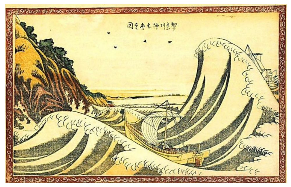
Great Wave, Hokusai, 1803.

Balancing the above four factors on the Japanese currency is difficult; at times it moves to extremes and presents attractive opportunities.